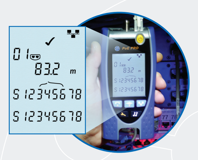
Wiremap with length