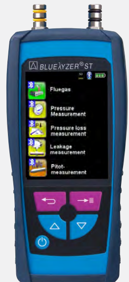
Example on our BLUELYZER ® ST