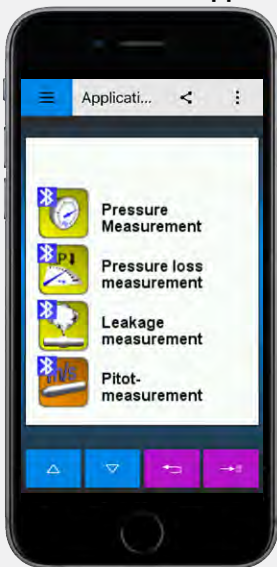
Example on your Smartphone