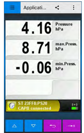
Example for measurement on EuroSoft live app