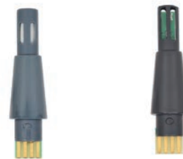
Hygrostick part number POL4750, for high moisture applications.

Readings from multiple Hygrosticks can be taken and recorded with ease. Humidity readings can be taken with the use of humidity sleeves or humidity box. Hygrosticks, not Humisticks, should be used for this test.