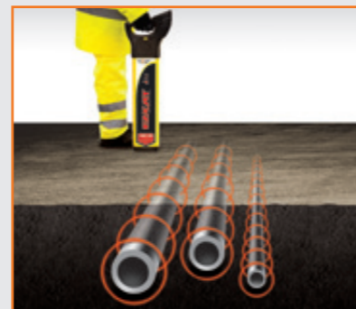
5 Implement changes to procedures for better results