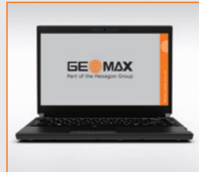
2 Send logged data to Bluetooth® enabled PC