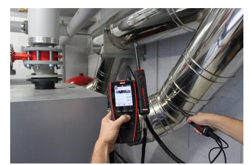
Hygrometry and air velocity measurement