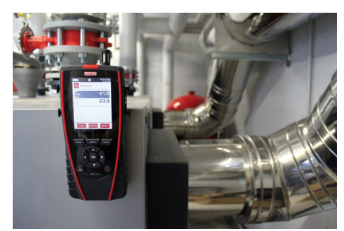
Climatic conditions measurement

AMI 310 SK: portable supplied with a ±500 Pa pressure module, a telescopic hotwire probe with gooseneck, a Ø6 mm Pitot tube, 2 x 1 m of silicone tube, a stainless steel tip