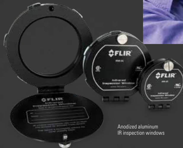
Anodized aluminum IR inspection windows