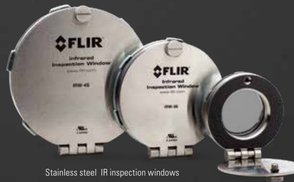
Stainless steel IR inspection windows