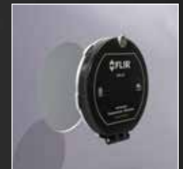
Step 2: Easy placement