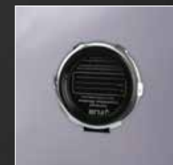
Step 3: Single PIRma-Lock™ ring nut