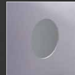
Step 1: One hole to cut