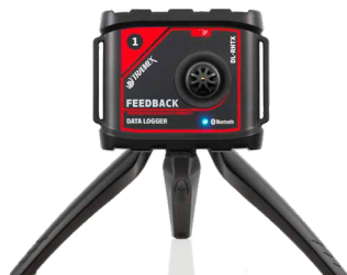
Product code: DL-RHTX