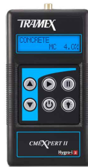
Product code: CMEX2