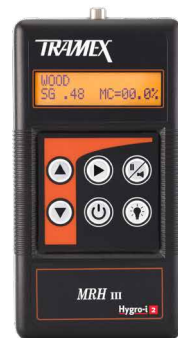
Product code: MRHIII