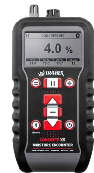
Product code: CMEX5

The Hygro-i2 ® probe is used with the CMEX5, Feedback DataLogger DL-RHTX, CMEX II or the MRH III for relative humidity testing of flooring slabs and ambient conditions. The Hygro-i2 ® probe is used to carry out in situ RH tests (ASTM F2170) and hood RH tests (British Standards 8201, 8203).